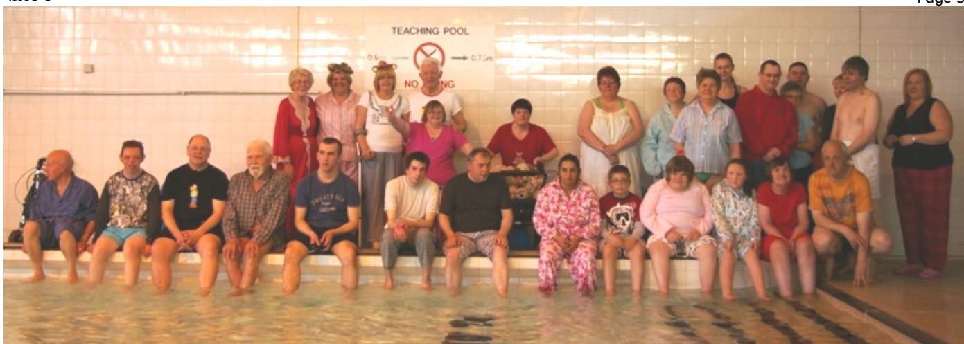
Above: Forth Valley's Dolphin swimming club pictured in their pyjamas before their sponsored swim at the Grangemouth Sports Complex